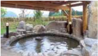
1 Kamioka Onsen Dakenoyu Shimokawahara maebiraki, Jinguji ☎0187-87-1700