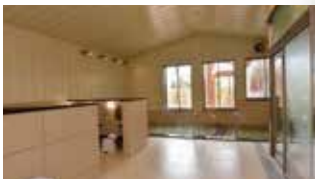
3 Nakasato Onsen Arayashiki Otacho Nakasato ☎0187-88-1471